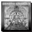
Chakra Chants 2